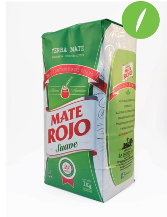
Mate Rojo (Suave) A high quality yerba mate with stems obtained from a careful process of elaboration. Smooth flavour. 1Kg pack.