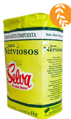
La Selva para Nerviosos (For nerves)