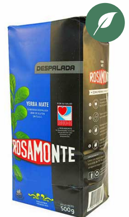
Rosamonte No Stems Traditional Rosamonte, strong in flavour but with not stems and low powder. 500 gr pack.