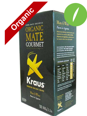
Organic premium with stems. 500 gr. Pack 10 units