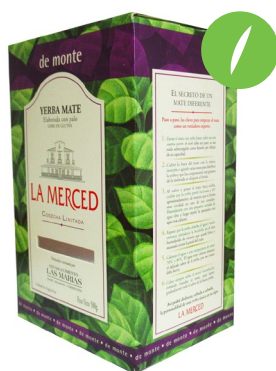
De Monte (From The Mountain)