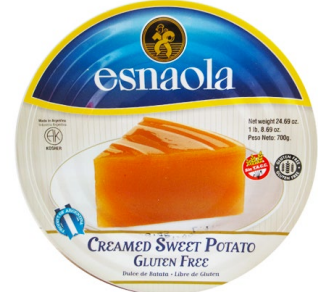
Sweet Potato Paste