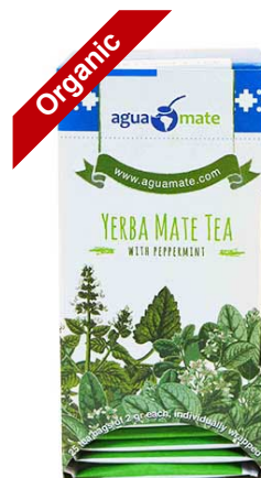
Yerba mate Unsmoked

Each package contains 25 bags of 2 gr each