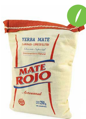
Mate Rojo (Artisanal) Beautiful linen bag with delicious mate rojo yerba mate. 250 - 500 gr bag.