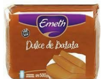
Sweet Potato Paste