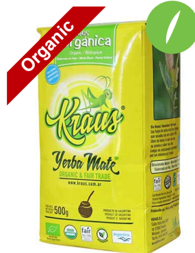
Organic with stems . 500 gr. Pack 10 units