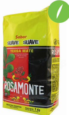
Rosamonte Suav (soft) Smooth yerba mate with stems; smoother than Rosamonte normal.