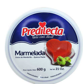
Quince Paste 600gr