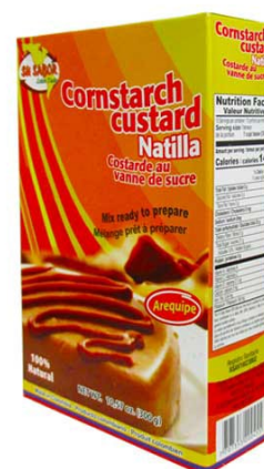
Natilla- Sweet Custard