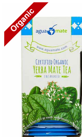
Yerba mate with peppermint