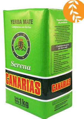
Serena 1Kg Pack 20 units