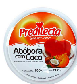
Pumpkin and Coconut Paste 600gr