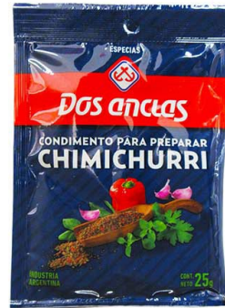
25 gr bag