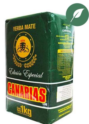
Canarias Special Selection 1Kg Pack 20 units