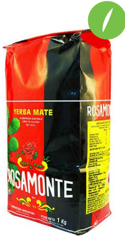
Rosamonte Normal (traditional) Yerba mate with stems. Traditional with a smoky flavour.