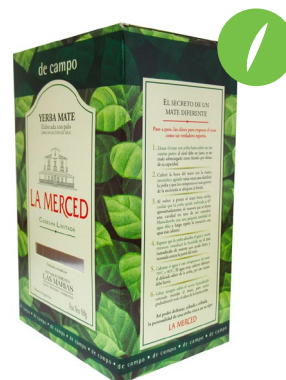
De Campo (From The Countryside)