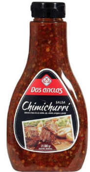
380 gr bottle