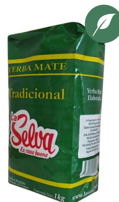
La Selva Tradicional