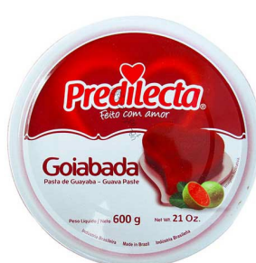
Guava Paste 600gr