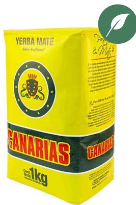
Canarias 1Kg Pack 20 units