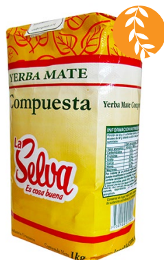
La Selva Compuesta (Compound)