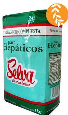
La Selva para Hepáticos (for Hepatics)