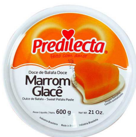
Sweet Potato Paste 600gr

Fruit pastes from Brazil Carton 12 Units (600gr each)