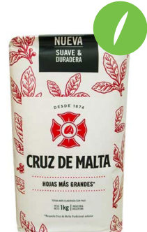
Cruz De Malta