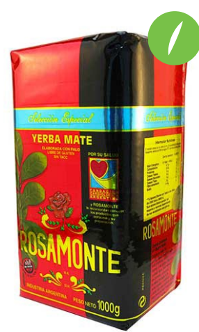
Rosamonte Special Selection: Yerba mate with stems aged for 24 months, strong flavour. Stronger than Rosamonte Normal