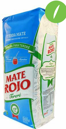
Mate Rojo (Tereré) Yerba Mate with a larger cut and low in powder especially to drinking cold mate (know as tereré). 500 gr pack.