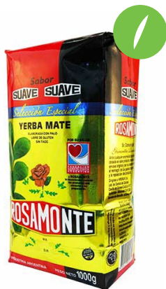
Rosamonte Suave Selección Especial Yerba mate aged for 12-18 month, softer than Rosamonte Plus and the tradicional special selection types.