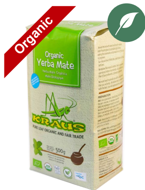
Yerba mate pure leaves 500 gr. Pack 10 units