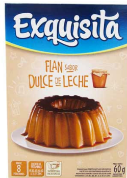
Dulce de leche