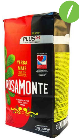
Rosamonte Plus Traditional Rosamonte but with an aluminium package for better product conservation.