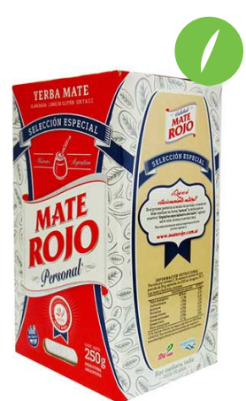
Mate Rojo (Personal 250gr) Small box of Yerba mate with stems