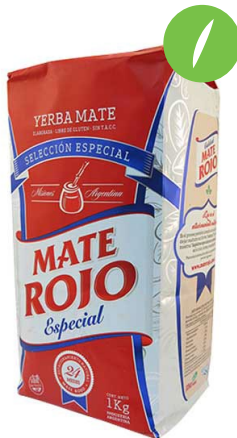
Mate Rojo (Special 1Kg) Yerba mate with stems, aged for 24 months with a smooth flavour.