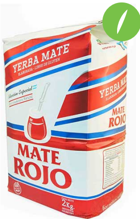
Mate Rojo (Special 2Kg) Yerba mate with stems, aged for 24 months with a smooth flavour.