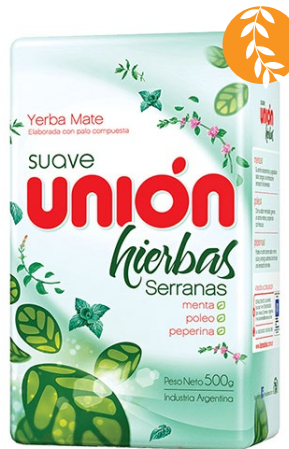
Soft with Mountain Herbs