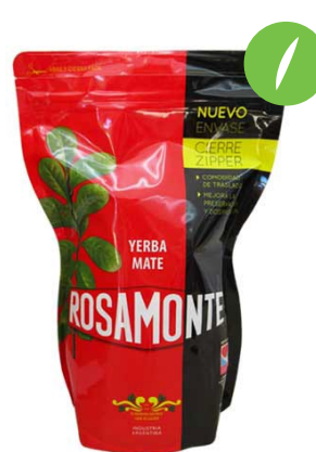
Rosamonte Normal in Ziploc bag Traditional Rosamonte, yerba mate with stems in practical Ziploc bags. 500gr pack.