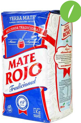
Mate Rojo (traditional) Traditional yerba mate with stems. 1Kg pack.